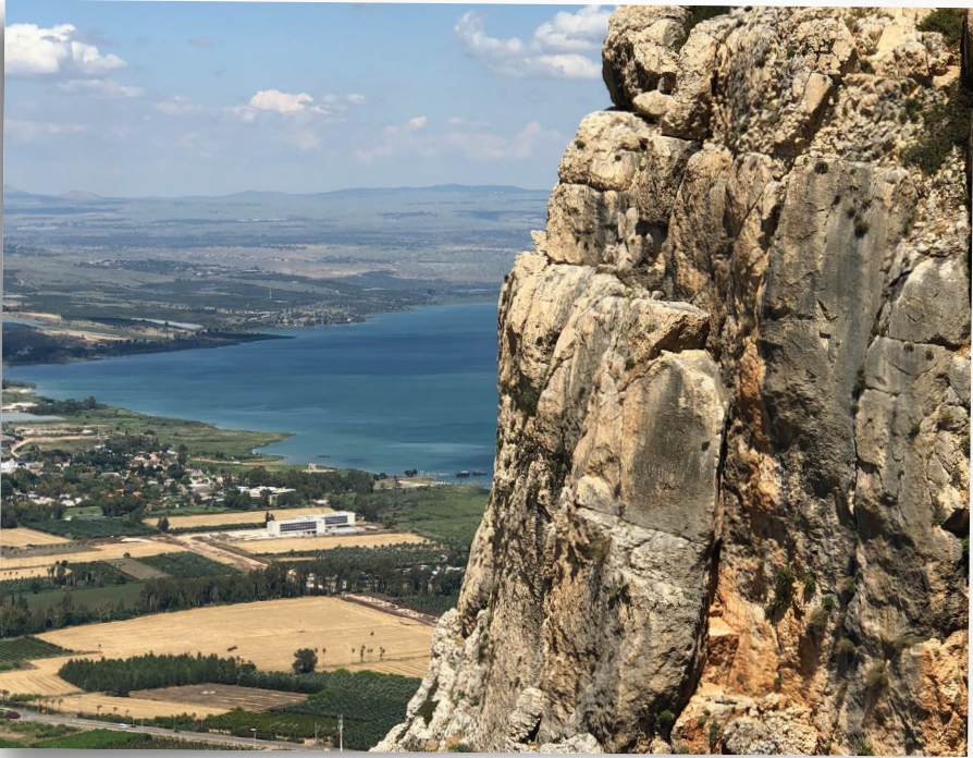
Looking down at the Sea of Galilee from Mount Arbel

The moment a pilgrim reaches the summit of Mount Arbel, all thoughts of sore feet, burning lungs, or achy knees vanish. They're replaced with a view of the Sea of Galilee 1,250 feet below. And unlike the sloping pathway taken to reach the top, a sheer cliff provides a dramatic vista of nearly the entire lake. It's like viewing a giant 3D map of the sea in vivid color!