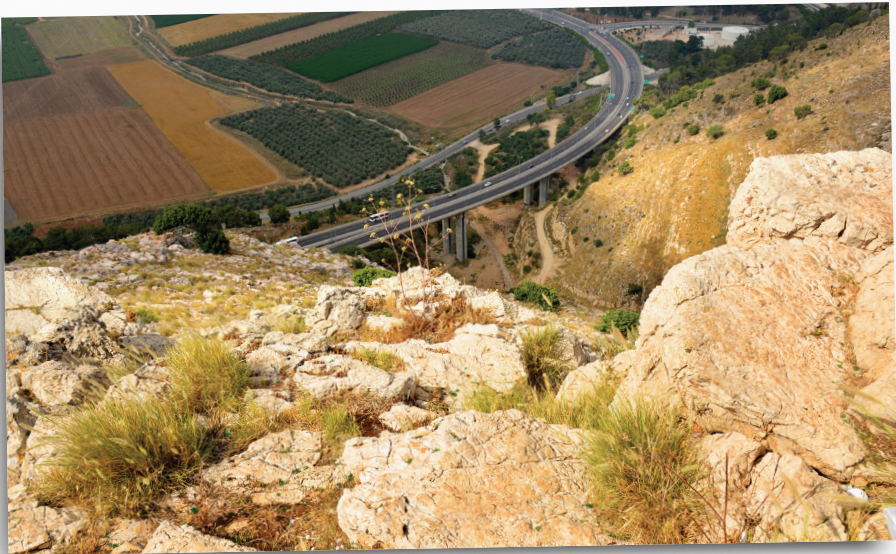
Looking down into the Jezreel Valley from the Mount of Precipice

Here on the Mount of Precipice we can also look down into the Jezreel Valley and see the new highway that tunnels its way through the rock, making the ascent to the top much easier than it was a few decades ago. But as the group looks down at the valley and roadway below, the story of Jesus returning to Nazareth in Luke 4 also comes into clearer focus. Jesus had returned to