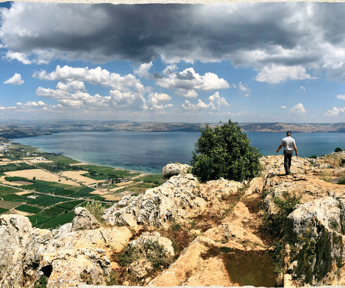
The Sea of Galilee from Mount Arbel