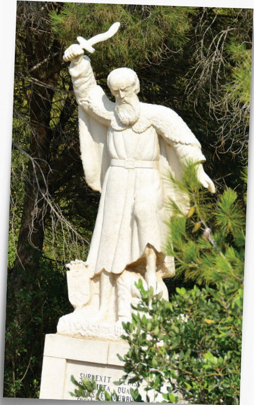
Statue of Elijah on Mount Carmel

After paying the entry fee, the guide leads the group across a plaza toward the main building. Some stop to take a picture of the statue of Elijah who is glaring menacingly down at them, sword in hand, threatening to slay any remaining prophets of Baal who might be hidden among the group. On reaching