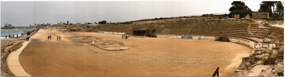
The hippodrome next to Herod's palace

One of the guide's many responsibilities on the tour is to keep the group moving. They want to slow down, breathe in the history, and populate the ruins with people from the Bible—Herod the Great, Herod Agrippa I, Peter, Cornelius, Philip the evangelist, Paul, Felix, Festus, and Herod Agrippa II. But the guide knows all the other sites the group must cover during this day. Like the White Rabbit in Walt Disney's Alice in Wonderland , they are all but shouting, "We're late, we're late! For a very important date! No time to say 'hello, good-bye,' we're late, we're late, we're late!"