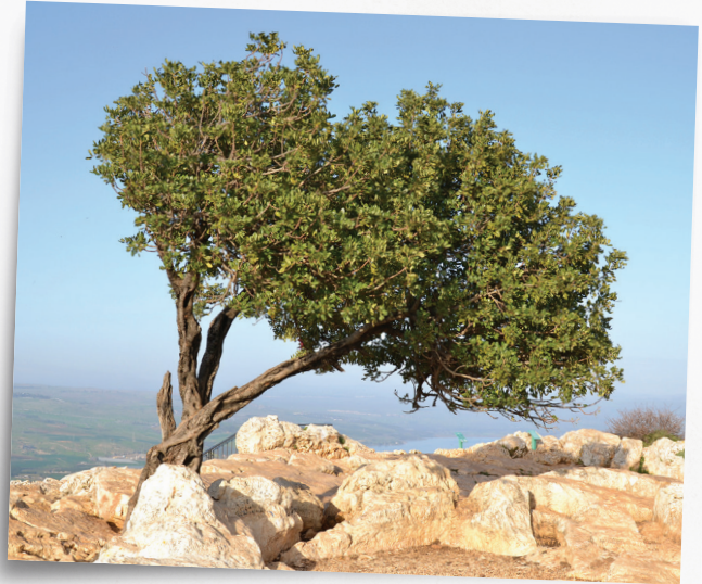
The lone carob tree atop Mount Arbel

Sadly, something happened to the tree. It's still there, but it's now only a shadow of its once beautiful self. I hope the tree recovers and thrives once