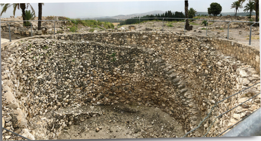
Grain storage silo built into the ground

less mobile “sheep” can separate from the more sure-footed “goats.” And as if to follow Jesus’ command in Matthew 25, the sheep head off to the right for a downhill walk back to the Visitor Center where the bus is waiting. The sure-footed goats take the pathway to the left heading across the rest of the site.