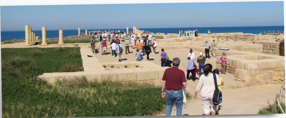
The site of Herod's palace and assembly hall

But when Paul was invited to speak, the scene changed. Paul shared his personal testimony, including his encounter with the resurrected Jesus of Nazareth. But Paul wasn't done. Speaking directly to these leaders who thought they held his life in their hands, Paul presented the claims of Jesus and called on them to respond to Him . Jesus was to “suffer and be the first to rise from the dead, and in this way announce God's light to Jews and Gentiles alike”