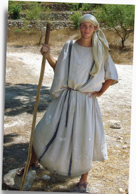
The Nazareth shepherd from "Goshen"

The highlight of our time there came when two young shepherds approached leading a small flock of sheep and goats. The older of the two appeared to be in his late teens or early twenties, and he watched with interest as we recorded. Finally, my cohost went over to see if he could speak with, and perhaps interview, this young shepherd.