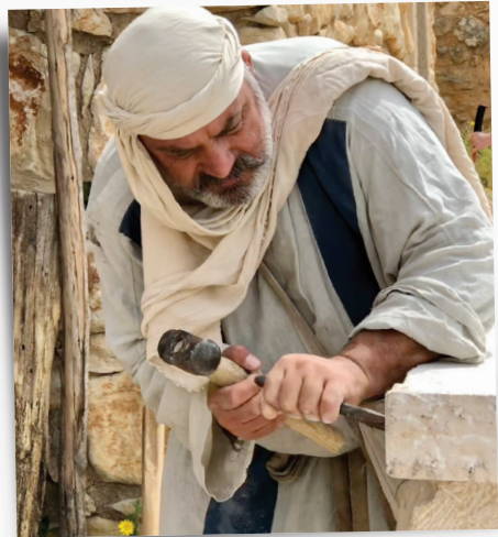
Stonemason at work in the Nazareth Village

Since this is a Protestant tour, the Protestant “holy site” in Nazareth is the Nazareth Village—and that’s our next destination. Nazareth Village is a