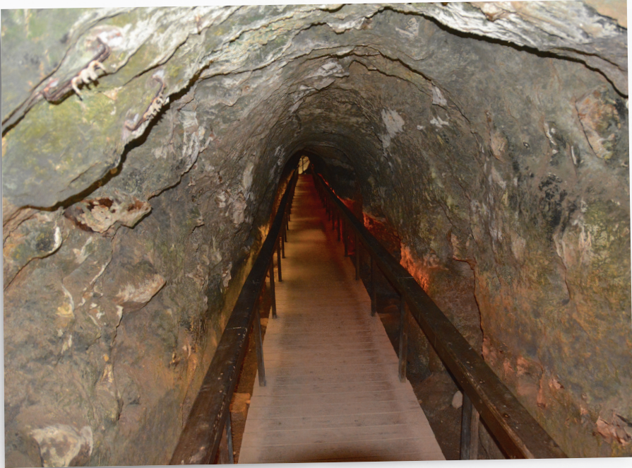
The water tunnel at Megiddo

Unfortunately, the tunnel ends all too soon, and we now have to climb the equivalent of eight flights of stairs to exit the water system. If our timing is right, the bus should be waiting for us at the end of the pathway. One more site checked off our itinerary!