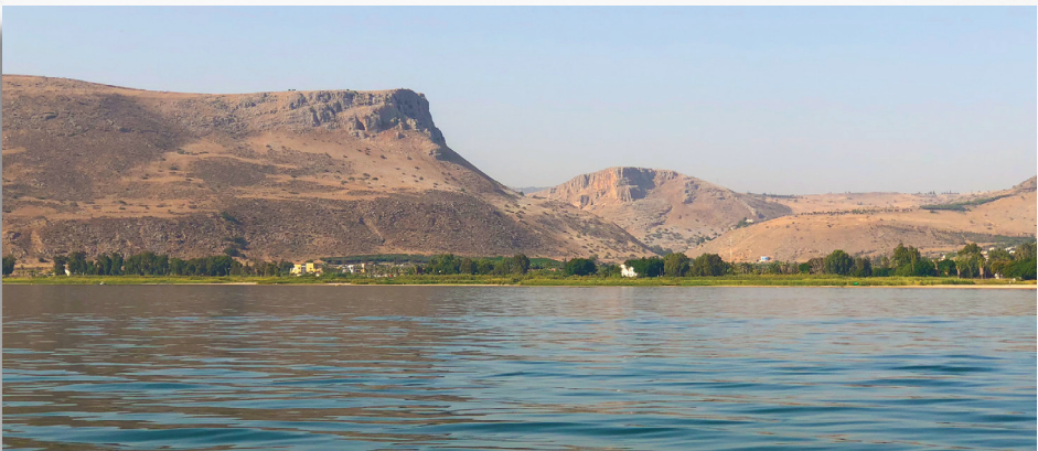
A view of Mount Arbel from the Sea of Galilee

Whenever possible, I want our group to visit Mount Arbel before they journey around the Sea of Galilee. Arbel provides a panorama that puts the individual sites around the Sea in perspective. Its vista gives pilgrims a visual framework in which to place the different locations. But it does one more thing. Mount Arbel's unmistakable profile provides a visual point of reference for us as we travel on and around the Sea of Galilee. It gives people a spot to which they can align the many sites they will soon visit. Just keep watching for Mount Arbel along the western shore.