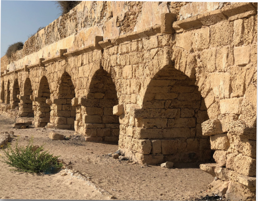
Remains of the Roman aqueduct

that in the hills off to the east. Instead, the city spread out along the shifting sands of the Mediterranean coast. Herod's original harbor is gone . . . sunk beneath the sea. The aqueduct that brought Caesarea its life-giving water now stands in majestic isolation from the rest of the city. The aqueduct's northern edge disappeared beneath the sand that has relentlessly reclaimed its territory, and its southern end has been torn away by the Mediterranean—leaving a gap between the aqueduct and the city it was built to serve. Vast parts of the ancient city itself still remain covered by sand.