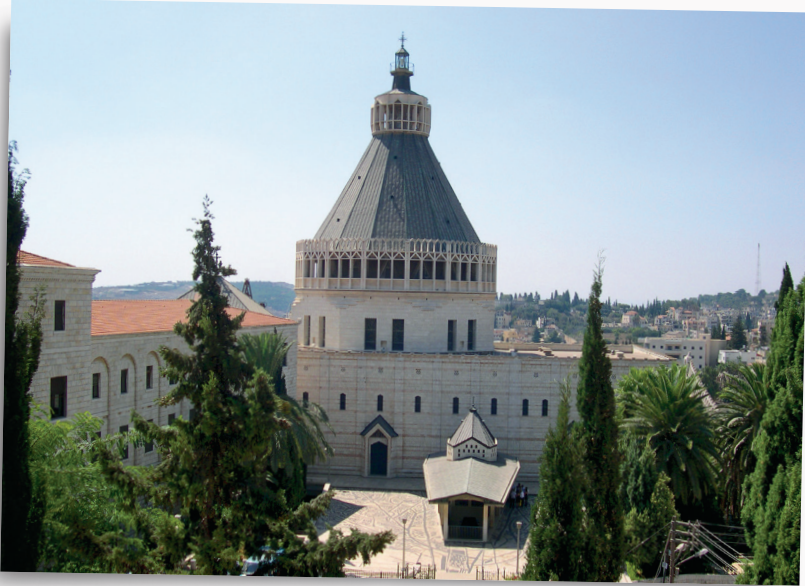
Basilica of the Annunciation

—this grotto stuff—but it is one that all men ought to thank the Catholics for. Wherever they ferret out a lost locality made holy by some Scriptural event, they straightway build a massive—almost imperishable—church there, and preserve the memory of that locality for the gratification of future generations. If it had been left to Protestants to do this most worthy work, we would not even know where Jerusalem is to-day, and the man who could go and put his finger on Nazareth would be too wise for this world.” 1