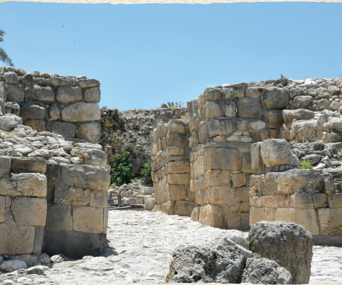
Remains of Bronze Age gate at Megiddo