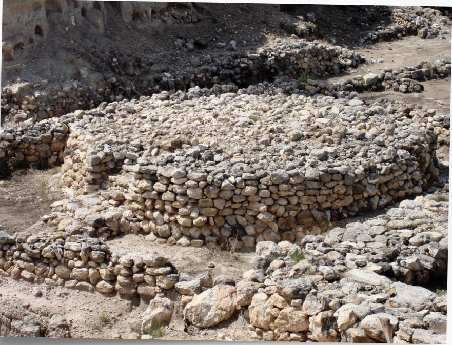
Canaanite altar discovered at Megiddo

useless as the iron-rimmed wheels sank into the mud. The group never got to see Megiddo, but they also never forgot the story of Deborah and Barak!