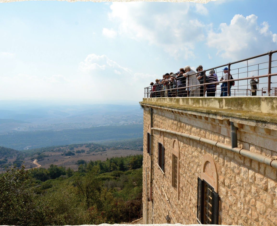
Looking out over the Jezreel Valley from the top of Mount Carmel