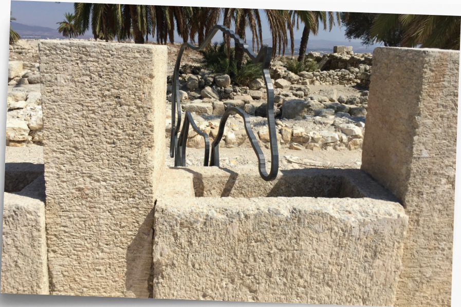
Stone manger with sculpture of a horse