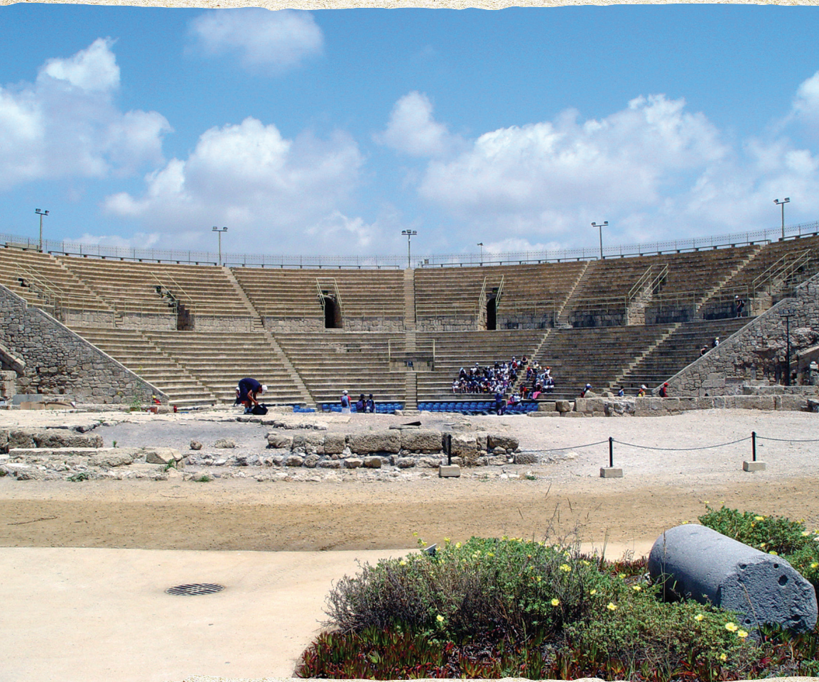
The Theater at Caesarea