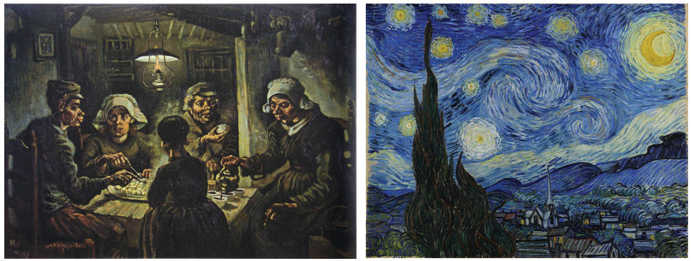
The Potato Eaters