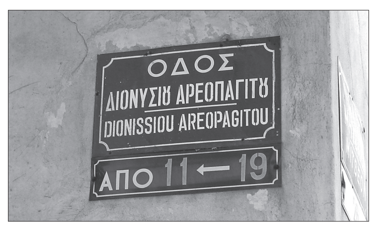
STREET SIGN IN ATHENS. "ROAD OF DIONYSIUS THE AREOPAGITE."

Also, the street that runs alongside the Acropolis in Athens is named after Dionysius, one of the members of the council who became a Christian after Paul's speech (Acts 17:34).