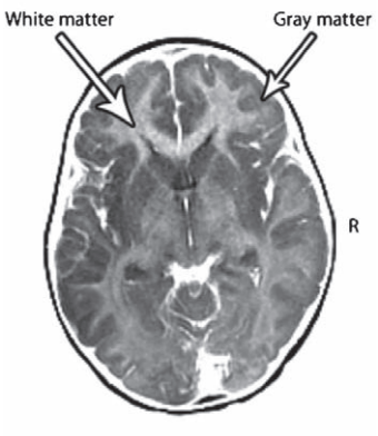
MRI cross section of the brain

Understanding white matter helps us appreciate why habits are so important. They go into operation before our conscious thought engages. People who build fasttrack skills into habits operate with